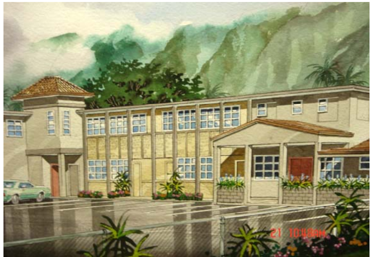
Architectural rendering of the New Parish Center – NOV 2008

This campaign, entitled " With Grateful Hearts ", is a wonderful opportunity for St. Ann's to address needs here at our parish and stand in solidarity with other parishes throughout our Diocese.